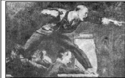
Billy Sunday preaching