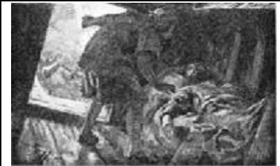
Jonah in the ship, sleeping